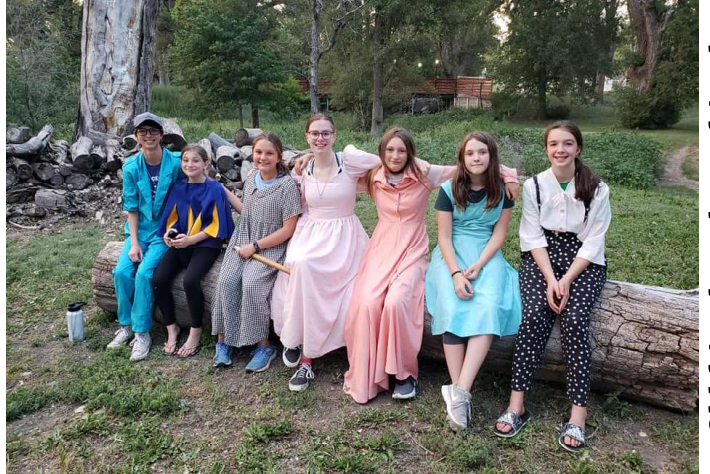
Old friends and new friends come togetehr at camp