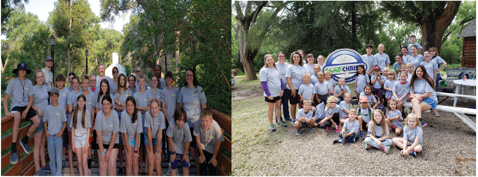
Middle School Camp