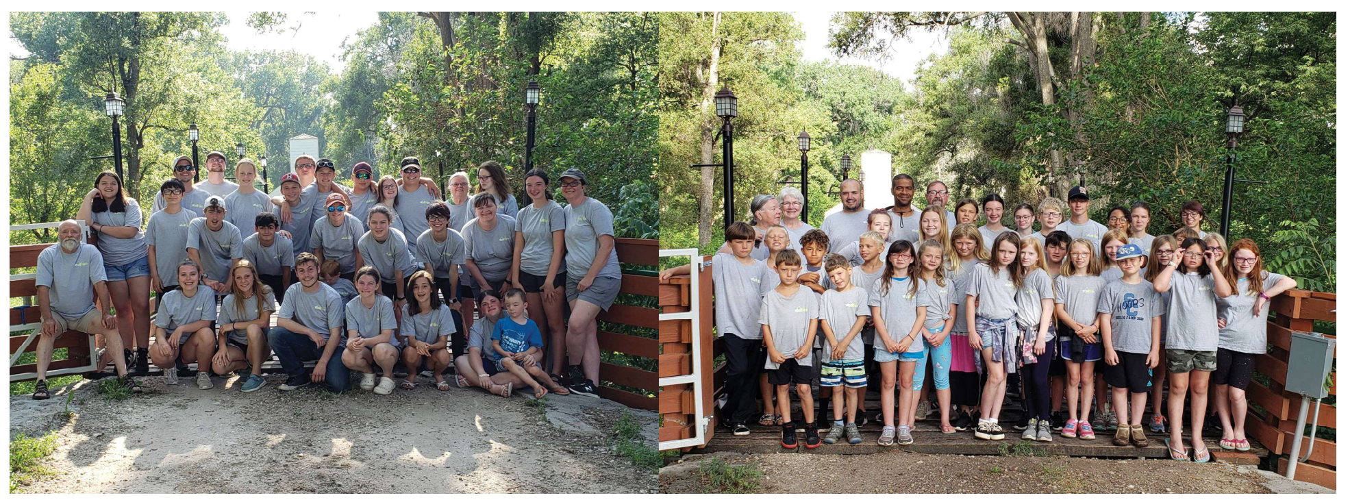
High School Camp

Campers at Camp Christy had a week of worship, games, swimming, and learning. We are so thankful for everyone at Camp Christy who makes camp possible. The ABCCR Camping Program is made possible by all of those who invest in the lives of our students and their walk with Christ!