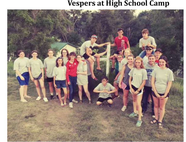
Vespers at High School Camp