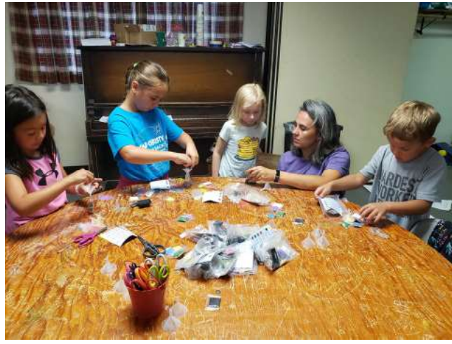
Craft time at Day Camp