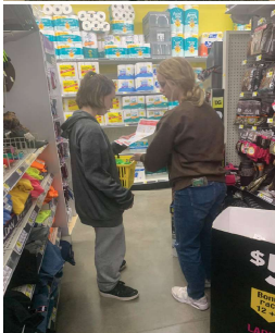
The youth group at First Baptist Church of Horton spend time shopping for items for Operation Christmas Child.