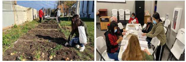
High school students helping harvest garlic and sending year end letters at Bethel Neighborhood Center.