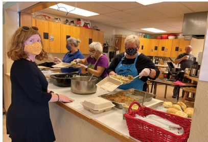
Thanksgiving Fellowship Lunch at First Baptist Church of Lawrence