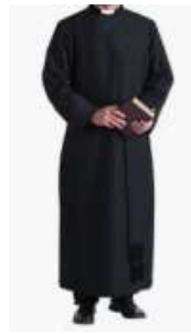
Plain Black Robe

All people tend to draw conclusions based on what is familiar and comfortable. Possibly, God may want change. When we make each question an approach to see how the candidate answers (or dresses) we may discover new, critical perspectives.